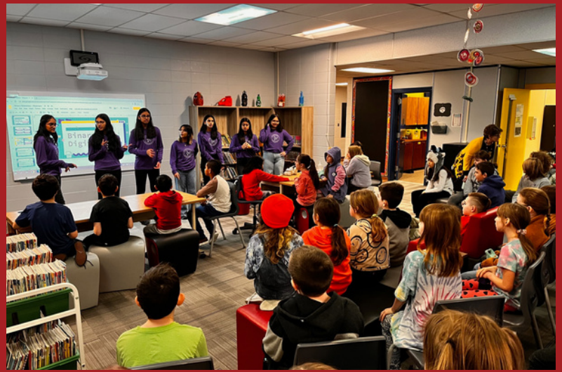
Westwood Women in Tech STEM Workshop