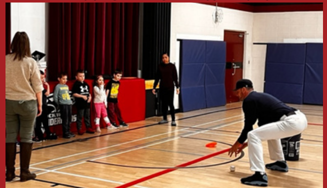
Fort McMurray Minor Baseball helped our Physical Education Classes learn about Baseball.

The RCMP visits each month to remind students to use their WITS when problem solving!