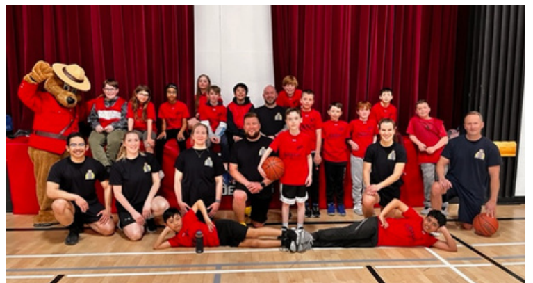
Thank you to the Wood Buffalo RCMP for playing our school basketball team before Spring Break with the entire school cheering them on!