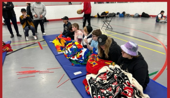
Students in grades 5/6 participated in a Dene Hand Games Tournament on April 6th.