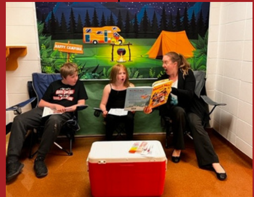
We had a great time at Family Literacy Night on April 27th.