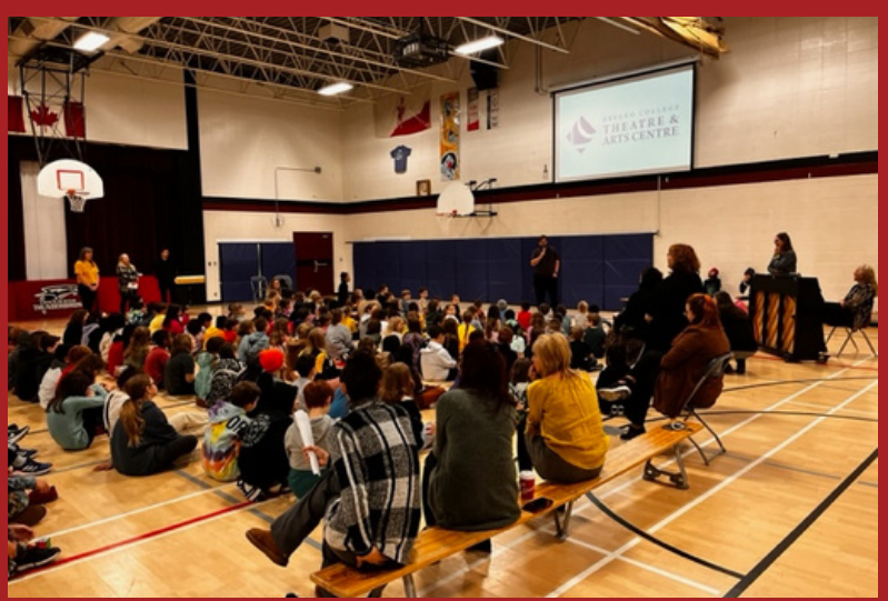
Keyano Theatre came in April to talk about Youth Theatre Opportunities on April 3rd.