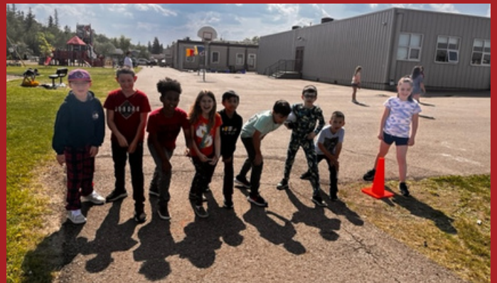
Students in all grades participate in Run club during Lunch Recess