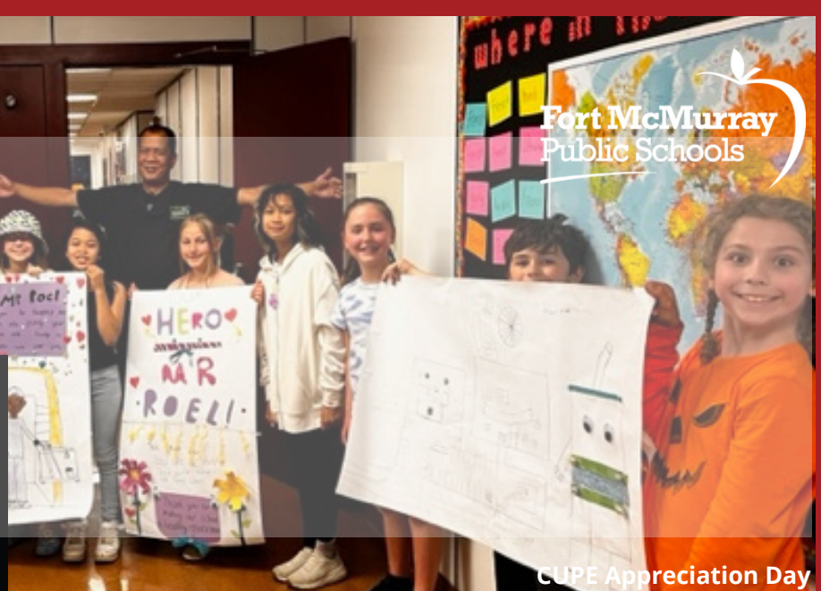
CUPE Appreciation Day

We have made it to the last month of the school year for 2022-2023 and what a year it has been! May brought more field trips to Heritage Park and the Oil Sands Discovery Center, the Track and Field City Competition, our school talent show, Multicultural Week hosted by our Student Council, FMPSD First Nation, Metis and Inuit Week, an appreciation parade for our amazing CUPE staff, and special guests from the RCMP, Nistawayou Friendship Centre and the Wood Buffalo Regional Library. The last four weeks of school in June have different events for our Thunderbirds each week before they go into the summer holidays after the last day of school on June 29th.