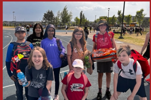
Our Grade Five and Six Track and Field Participants had a great time at the City Competition

Students explored a map of the world and identified areas they have lived or have family during Multicultural Week