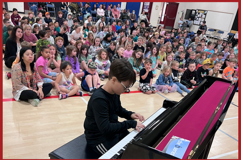
Talent Show Finalist performed in front of the entire school at our May Assembly