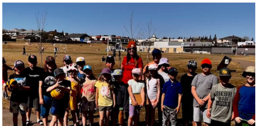
Wednesday, May 3rd was Hats on for Mental Health across Alberta to promote the importance of good mental health.