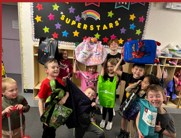
Anything but a Backpack for Spring Theme Week