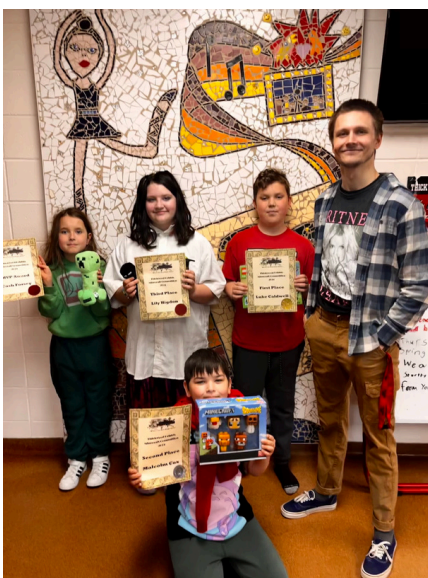
Minecraft Competition Winners

Our Fun Run, Waterpark Day and Field Afternoon all need volunteers to be a success. Alien Inline can also use volunteers in the younger grades to help students gear up and gear down. Please reach out to the school at 780-743-8417 if you are able to help out.