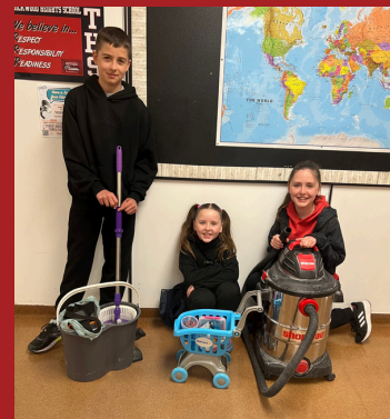
St. Paul Fun Run